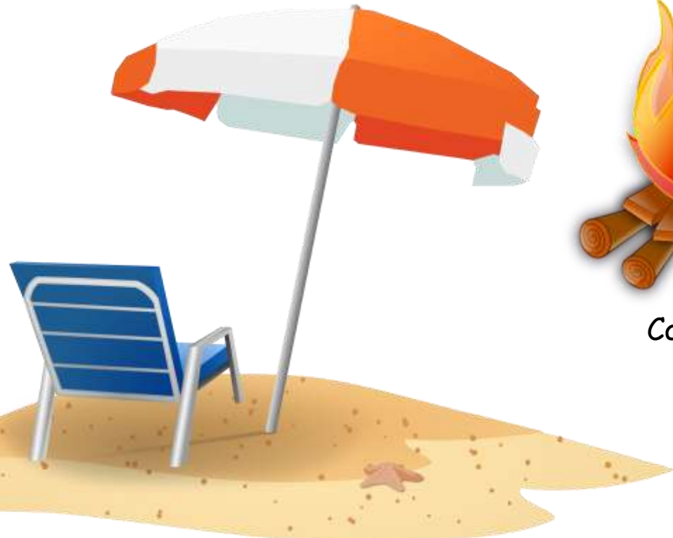
Leisure Time & Wandering on sea beach