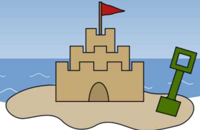
Make Sand Castles