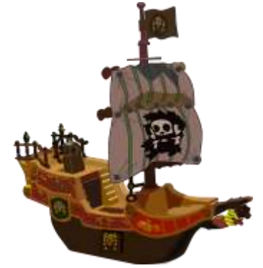
Make Thermocol Boats