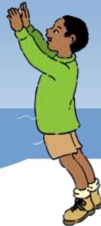
Play Games like Volleyball, Beach Games...